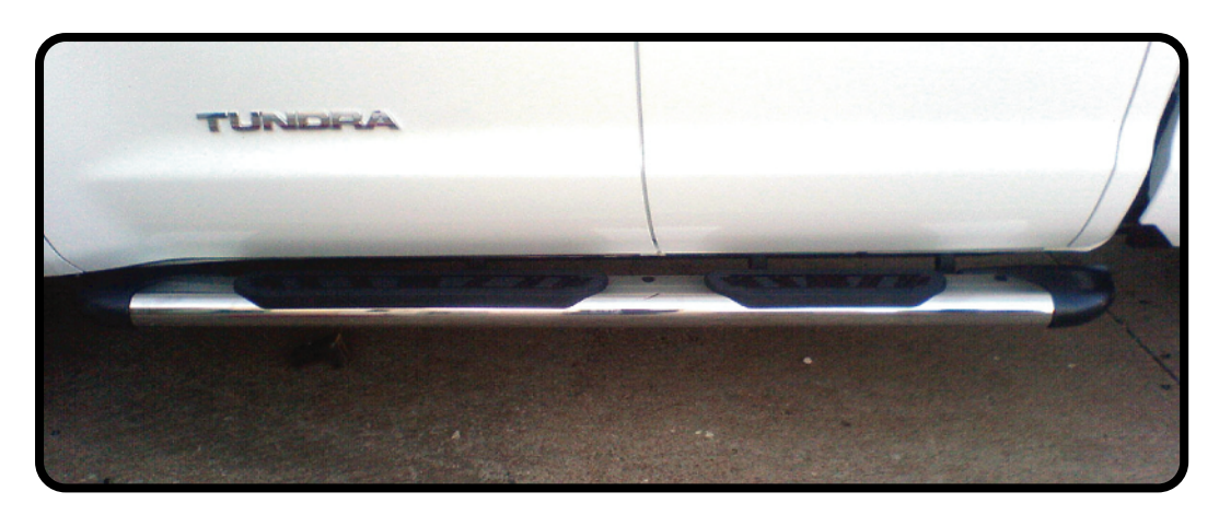
2007 Toyota Tundra Double Cab